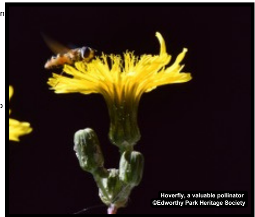
Hoverfly, a valuable pollinator