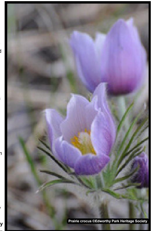
Prairie crocus