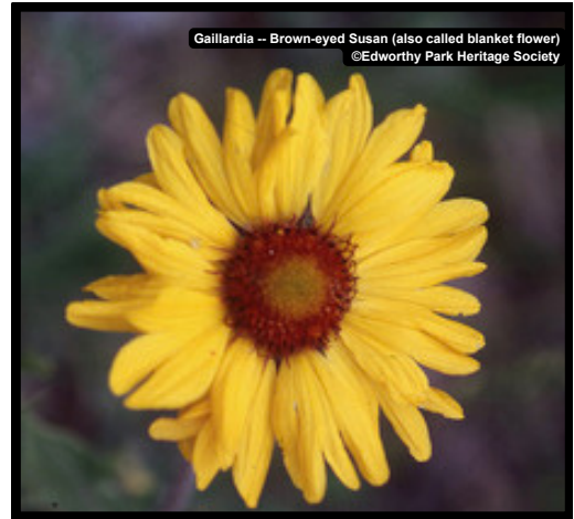
Gaillardia -- Brown-eyed Susan (also called blanket flower)

— Edworthy Park Heritage Society eparkhs@gmail.com